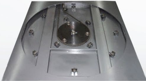
SONIC LPS ▶