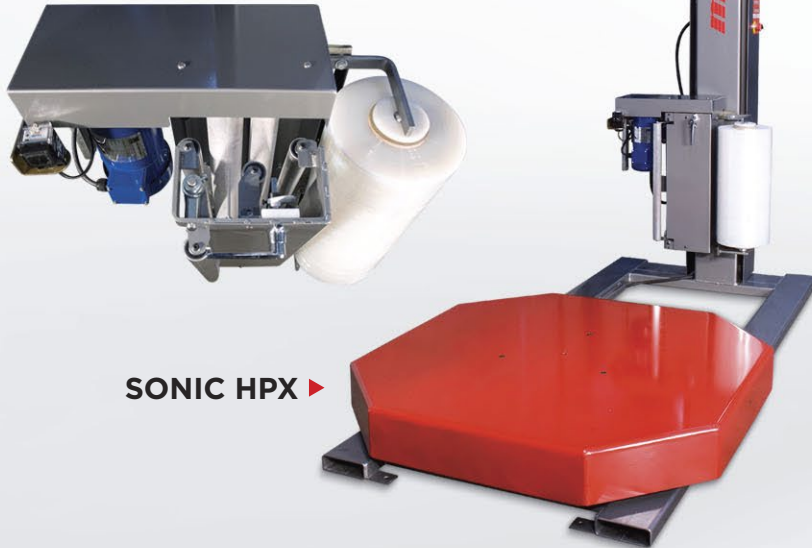
SONIC HPX ▶

The X-TRETCH pre-stretch film carriage provides superior film economy, film tension and user safety.