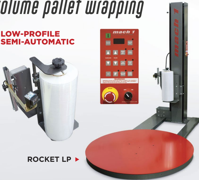
ROCKET LP ▶

The E-STRETCH film carriage provides consistent film force and stretch to securely wrap pallet loads