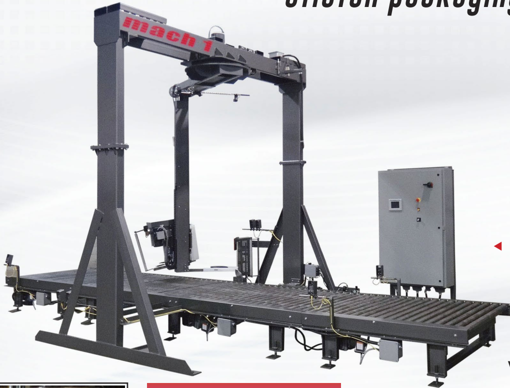
◀ DYNAMIC RT