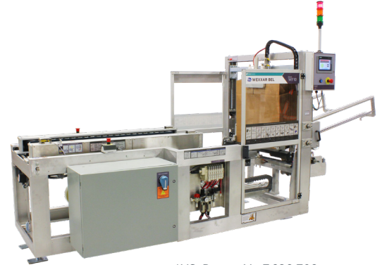
*US. Patent No 7,828,708

In addition to Wexxar Bel's patented Pin & Dome system also found on other WF machines, the WF10 is equipped with servo drive technology, allowing full control of the forming head and case delivery for a more consistent seal. The WF10 also has significantly lower air consumption, providing energy and cost savings in an eco-friendly operation.