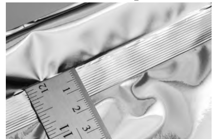
Serrated Seal Example